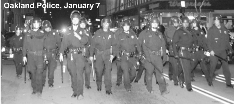
Oakland Police, January 7